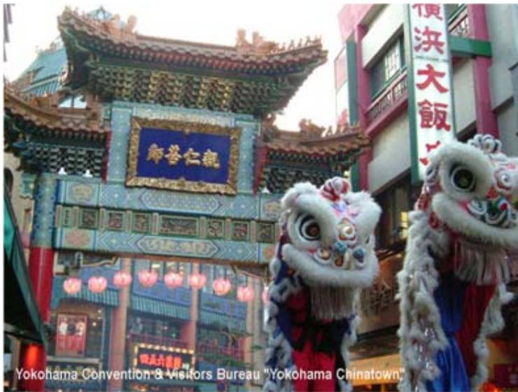
Yokohama Convention & Visitors Bureau "Yokohama Chinatown"