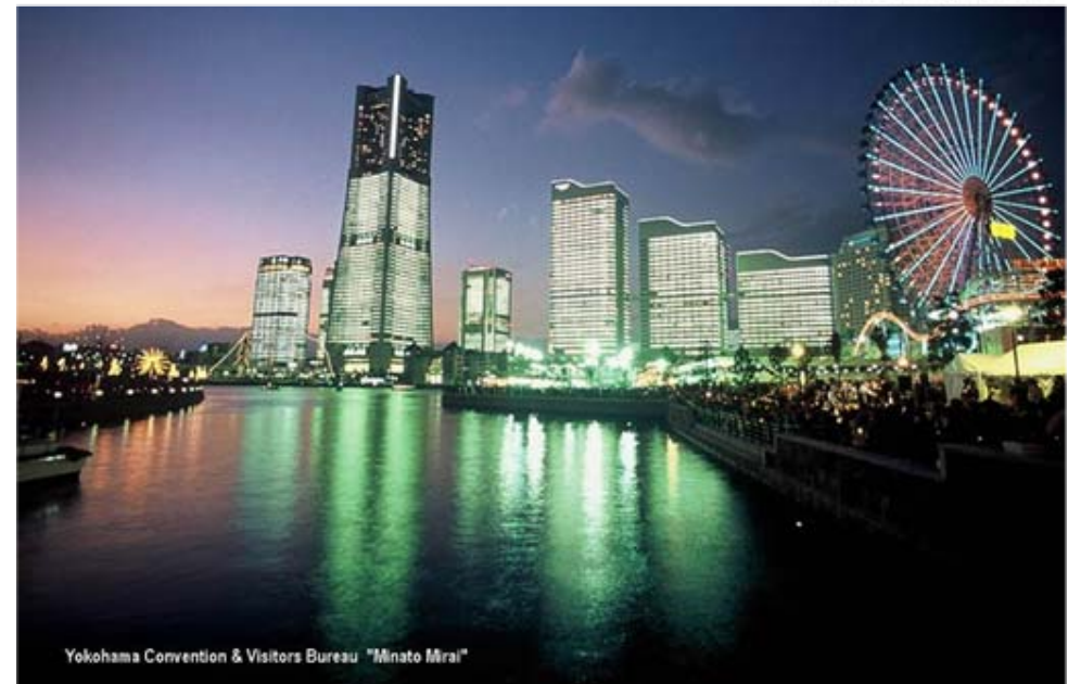
Yokohama Convention & Visitors Bureau "Minato Mirai"