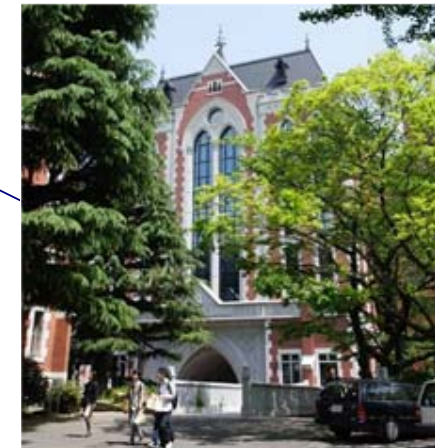
Mita Campus Humanities and Social Sciences