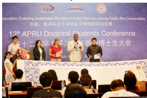
Unveiling of the APRU DSC Tsinghua Declaration led by Doctoral Students Network (DSN) representatives.