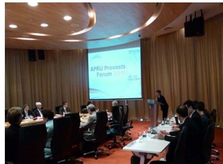
APRU provosts at the forum's summary session.