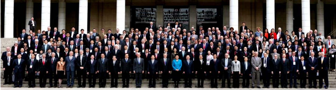
GSUP and APM delegates gather in front of Tsinghua University's Main Building.