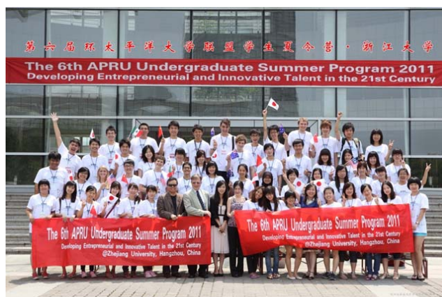
Students wave their national flags during the group photo.