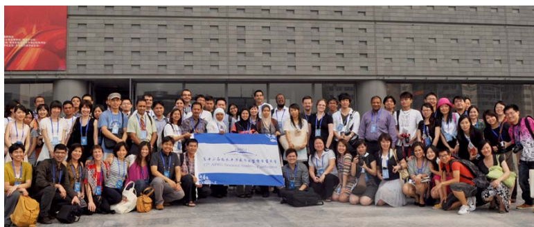
DSC participants visit the Capital Museum of China in Beijing.

His current research focuses on the globalization of higher education and he is a member of an EU-funded research project on this theme.