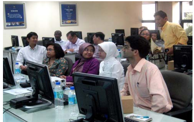
Participants interacting and engaging at the workshop session.

Looking ahead: (1) A major CMAS policy-oriented workshop will be hosted by the Rector of the University of Indonesia in Jakarta from March 18 to 19, 2010, (2) CMAS has submitted a proposal to participate in the Singapore International Water Week (SIWW) in June 2010, and (3) an AWI Climate Change book tentatively titled, "And Not a Drop to Drink: Water, Pacific Rim Cities, and Climate Change," will be published by World Scientific (Singapore) in December 2010.