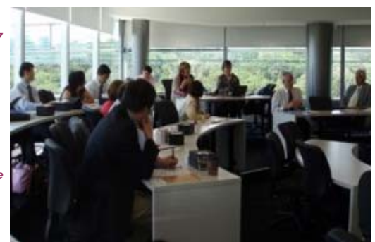
RIGHT: A lively discussion at the 2nd Education Deans Meeting.