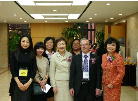
Keynote speakers together with some of the symposium attendees.

Participants also conducted site visits to the Seoul Metropolitan Government headquarters and several senior welfare centers.