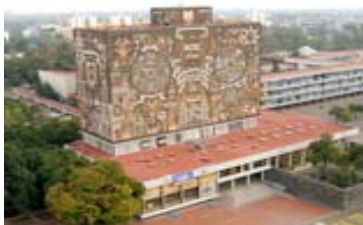
National Autonomous University of Mexico