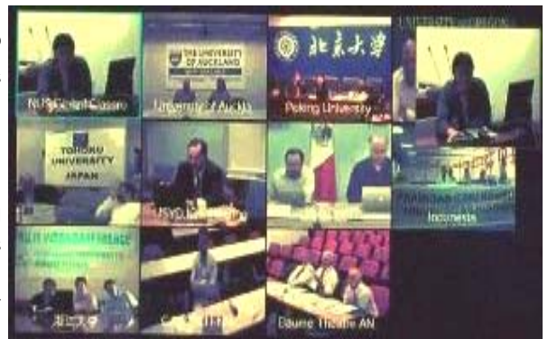
Through a virtual bridge, participants share views and best practices in grid computing.

The first of this series was Grid Computing held on October 21, 2009. The inaugural Video Conference Session focused on various grid technologies, applications and global grid consortium partnerships involving a number of APRU member institutions. Hosted by National University of Singapore (NUS), the virtual conference was joined by over 30 participants across 17 APRU universities from Australia, Chile, China, Indonesia, Japan, Mexico, New Zealand, Singapore and the United States. Six universities reported ongoing initiatives, management and use of grid resources for research computing and infrastructure in their campuses.