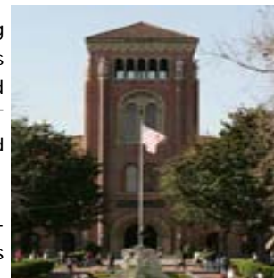
University of Southern California

technologies in the use and application of IT by academics in APRU institutions in research, teaching and learning, and administration. The ERT initiative hopes to bring together APRU faculty, researchers and experts in IT to understand one other's roles and how collaborative efforts can contribute to creating holistic IT infrastructure at members' respective campuses. ERT topics may include teaching and learning pedagogy, high performance computing, cloud computing, virtualization, green IT, security and governance.