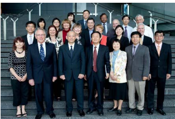
LEFT: Delegates representing 17 APRU schools and faculties of education.