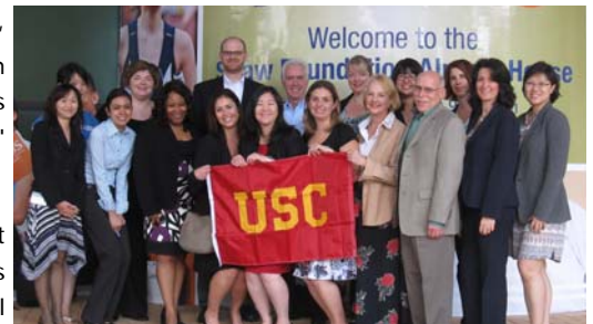
Faculty and doctoral students from USC Rossier School of Education with the APRU Secretariat team.