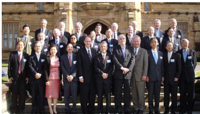
APRU 10 th Annual Presidents Meeting: University presidents and APRU's key officers at University of Sydney.