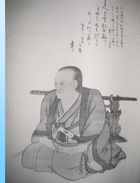
OGATA KO-AN (緒方洪庵) 4